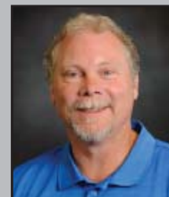
Paul Brown Event Management