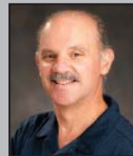
Rich Bertolucci Sports Information