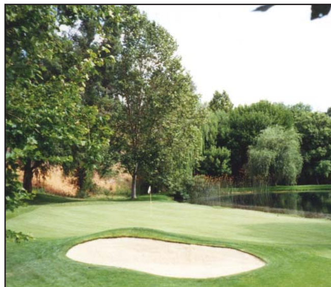
Valencia Country Club